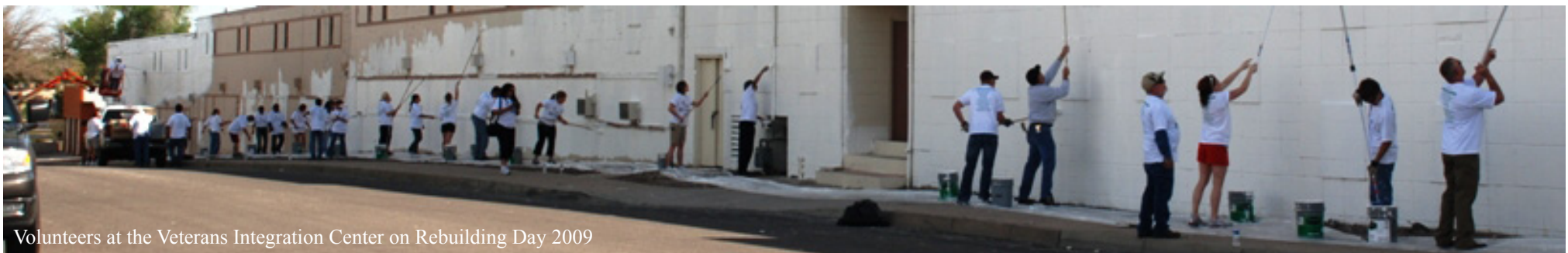
Volunteers at the Veterans Integration Center on Rebuilding Day 2009